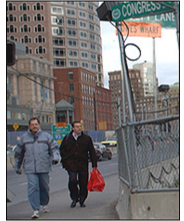
Pedestrians navigate a temporary sidewalk at the 500 block of Atlantic Avenue yesterday.