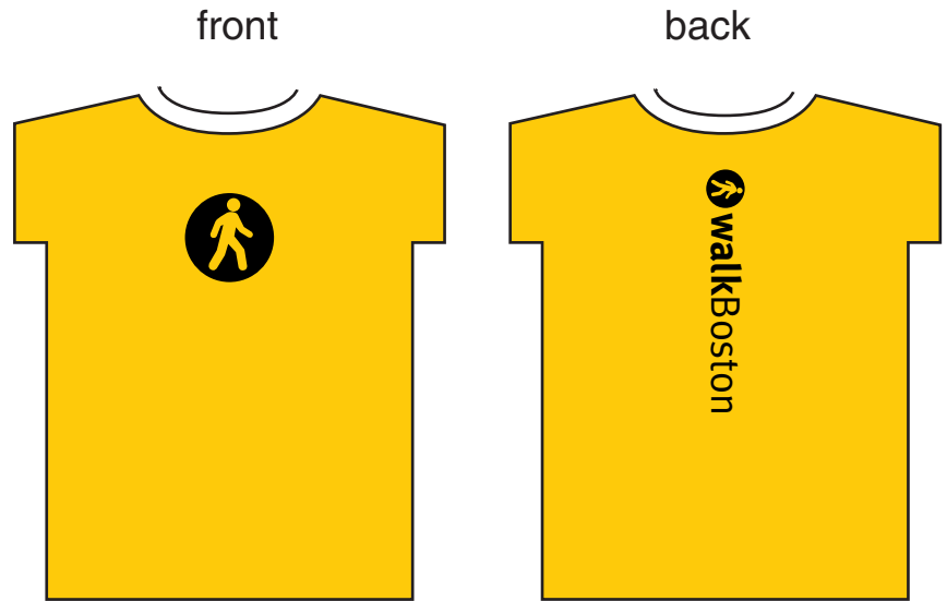
VOLUNTEER T SHIRT